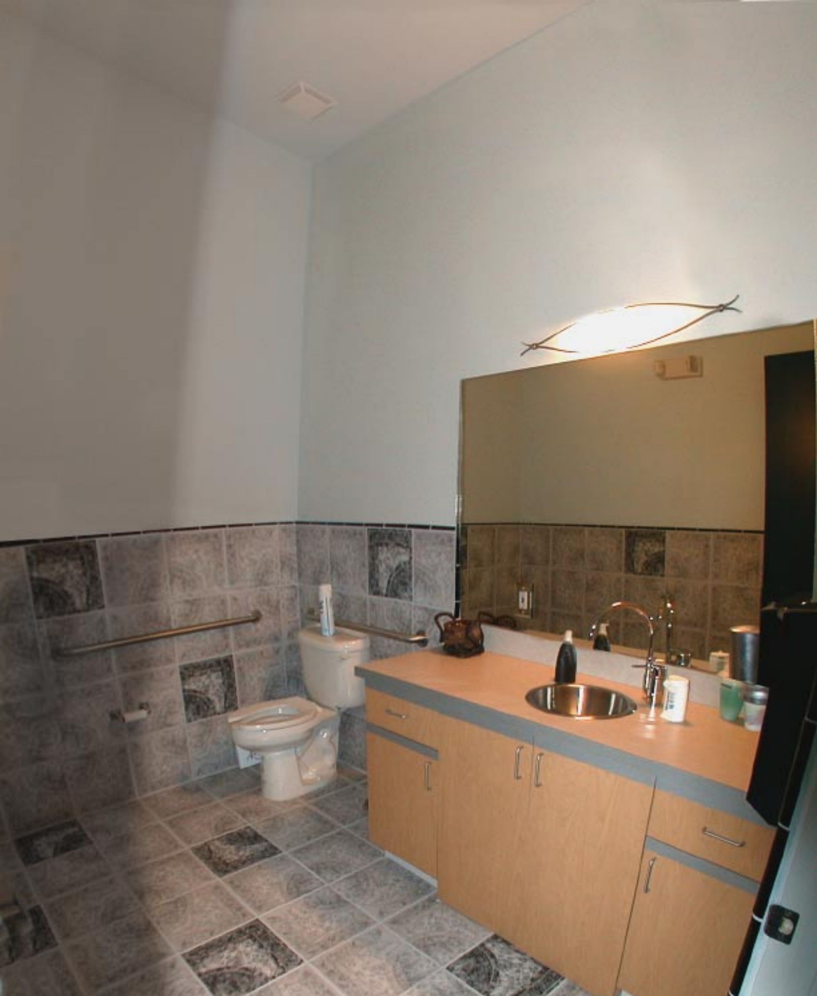
Handicap-Accessible and Chic, our Patient Bathroom is Extremely Spacious.