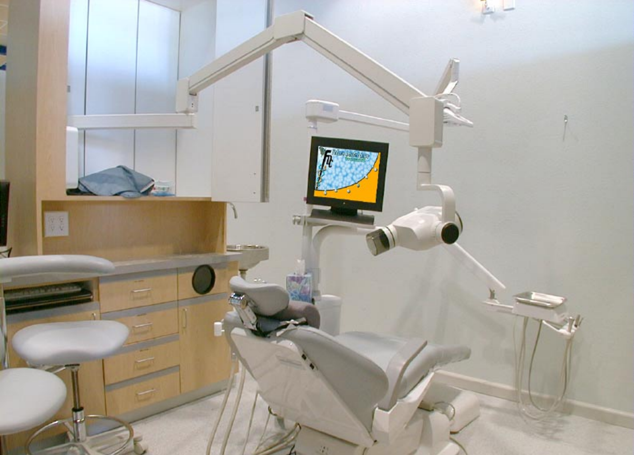
Hidden Articulating X-ray Armatures can Reach Fully into Adjacent Operatories.