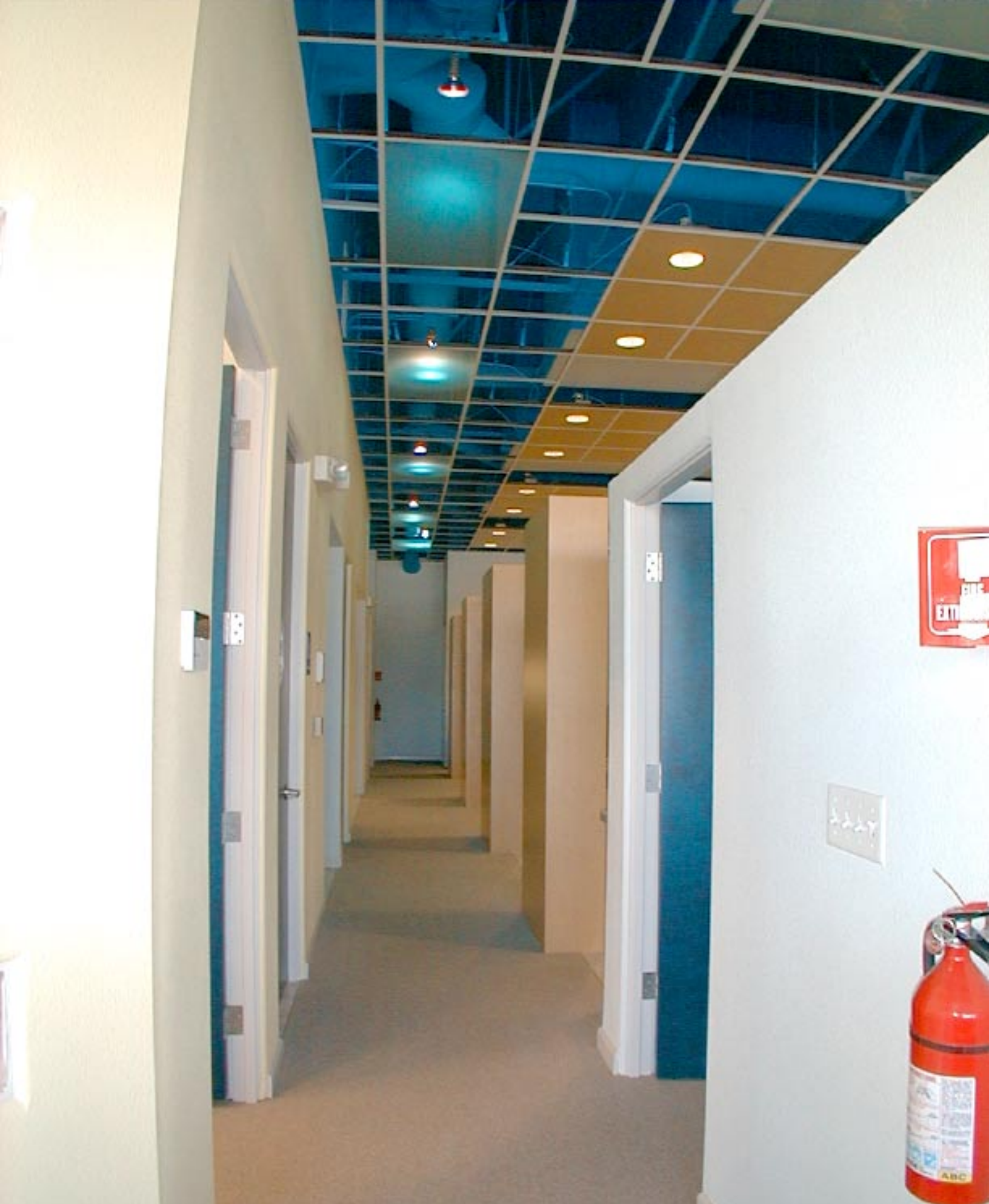
This is our Main Hallway looking toward the rear of the Building.