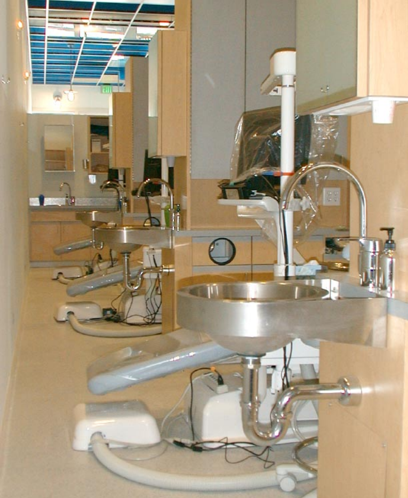
Easy Inter-Operatory Access includes Strategically Located Custom Sinks.