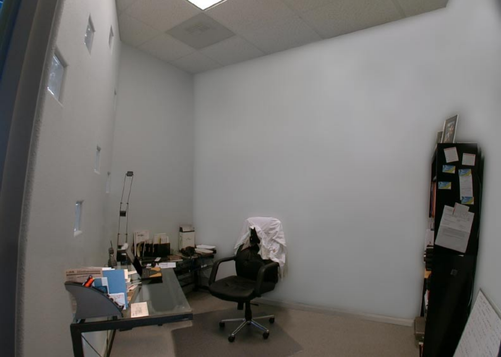
A Spacious Personal Office accomodates Paperwork, Business Functions, and Privacy.