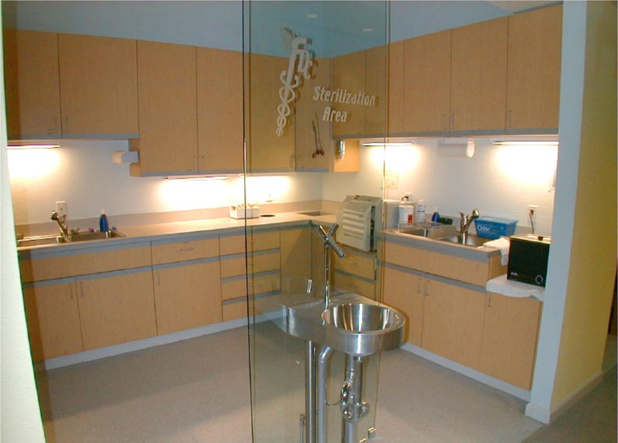
This is the Patients' View of our Sterilization Area as they walk down our Hallway.