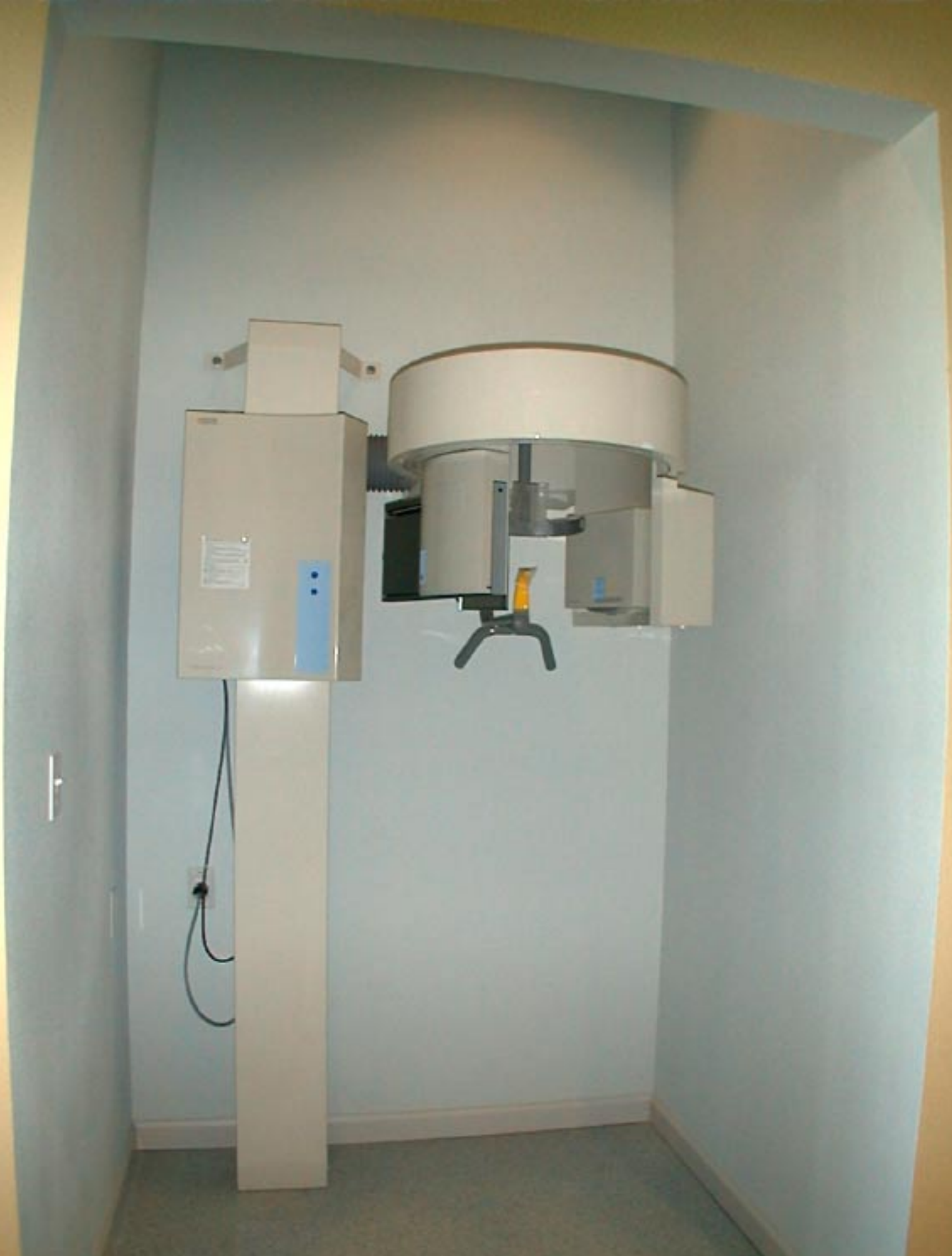
Our Panorex Machine is situated Centrally and is Well Shielded.