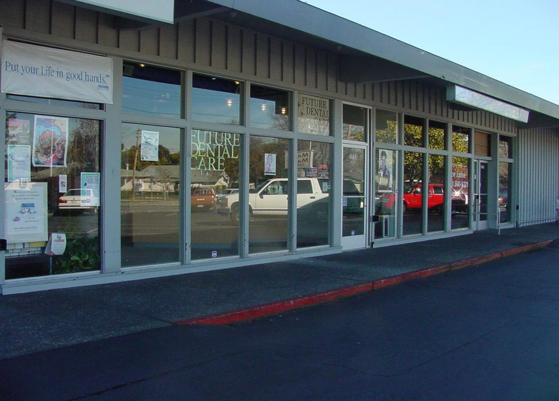
Our 2000 SF Office awaits the arrival of our Custom Outdoor Signage currently being manufactured.