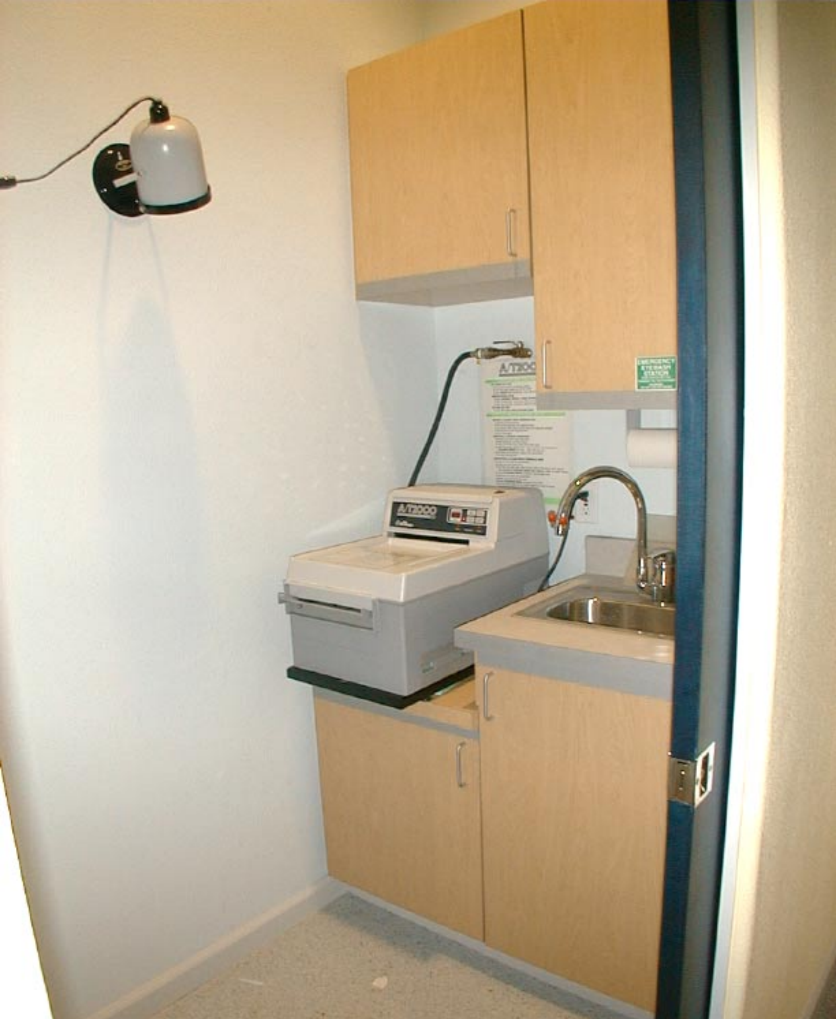
Our Darkroom facilitates Efficient Film Processing and Handling.